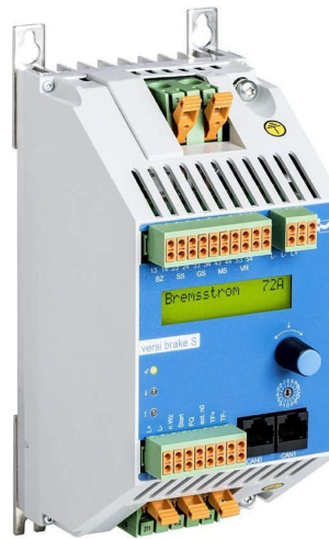
Braking Devices VB S [72 – 360A]